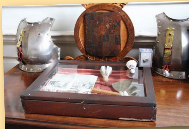
The International Space Station Shuttlecock with old battledores and shuttlecocks in the North Hall, Badminton House.