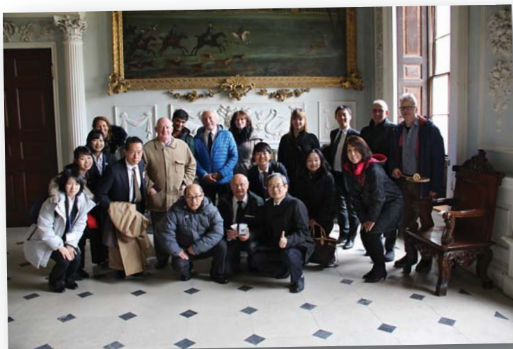
Visitors in the North Hall, Badminton House.